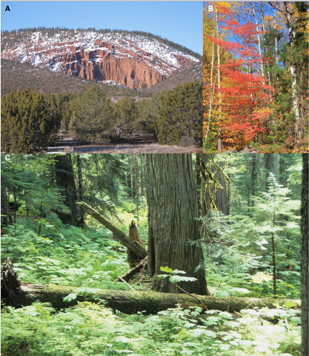
Plate: Vegetation types featured by the vegetation-plot database GIVD NA-US-001.

A: Pinus-Juniperus forest in northern Arizona, March.